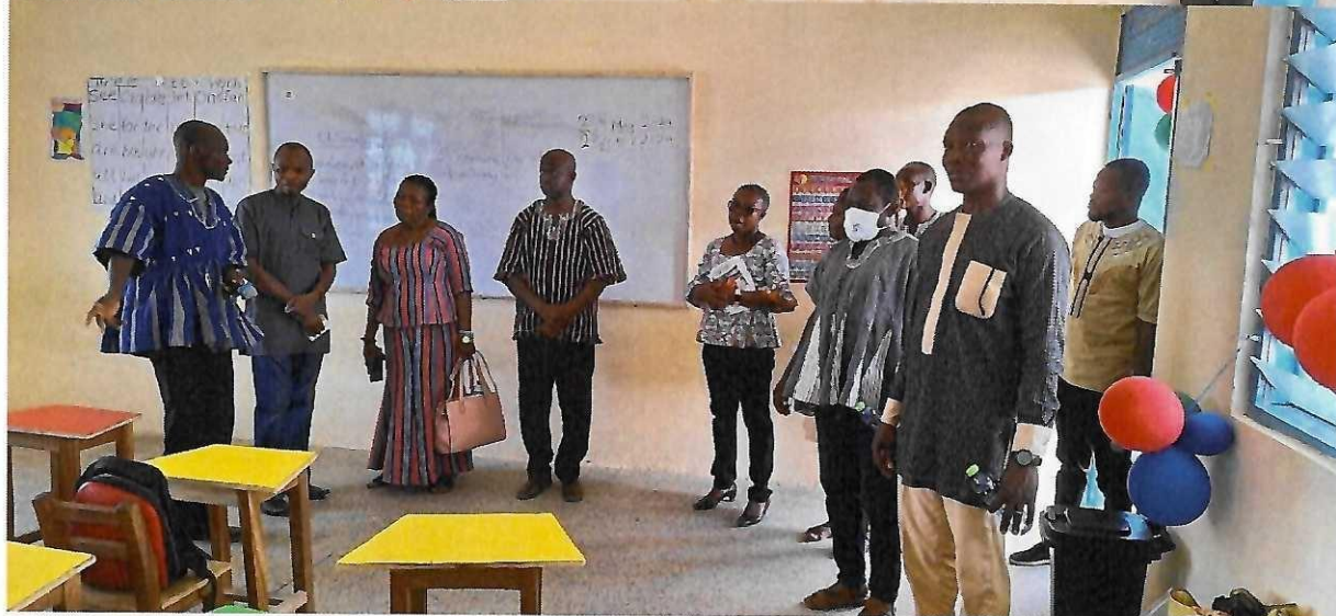
Inspection of the facility conducted by the head teacher